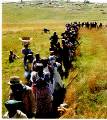
Visual Vocabulary Here a queue (kyū) means a line of people.

a miner, to find out what was what. The only thing he did find out in the end was that that little house of his was even a greater blessing than he had thought. Some of his fellow ex-miners who had nowhere to return at the end of the day's waiting just slept outside the doors of the offices and cooked what meal they could scrounge together in Bournvita tins. As the weeks lengthened and still nobody could say what was what Jonathan discontinued his weekly visits altogether and faced his palm wine bar.