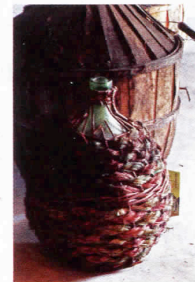
Visual Vocabulary A demijohn is a large earthenware or glass bottle, encased in wicker.

"I count it as nothing," he told his sympathizers, his eyes on the rope he was tying. "What is egg rasher ? Did I depend on it last week? Or is it greater than other things that went with the war? I say, let egg rasher perish in the flames! Let it go where everything else has gone. Nothing puzzles God." 🌀