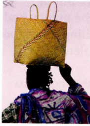
Visual Vocabulary A raffia bag is one woven from the fibers of the raffia palm tree.

with which he had been going to buy firewood which his wife, Maria, retailed to